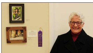
Merit Award $50 Shelby Sabelli Boots , watercolor