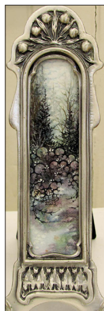
Second Place $150 Lorene Lovell A Place to Ponder , watercolor