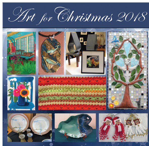
Above: Items from last year's Art for Christmas

Note: You must be a current member to sell your work. Entry and membership forms are available at SASi and on SASi's website. SASi takes 30% commission.