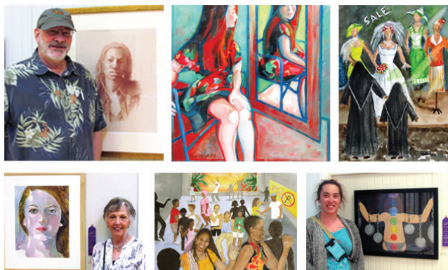
Winners, left to right

The I Am Woman exhibit will be on view in the galleries of Southern Arts Society April 14 through May 31